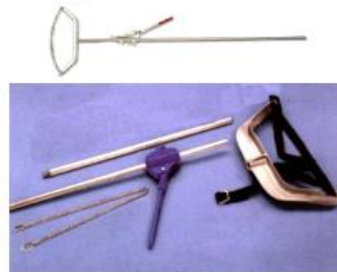
HK Calf puller