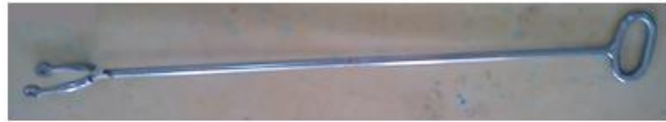
Kuhn's crutch repeller