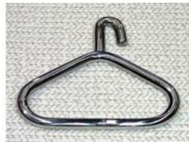
Muir's chain handle