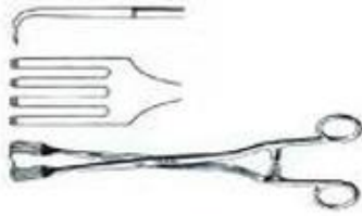
Pratt vulsellum forceps