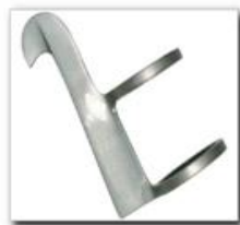
Gunther's finger knife