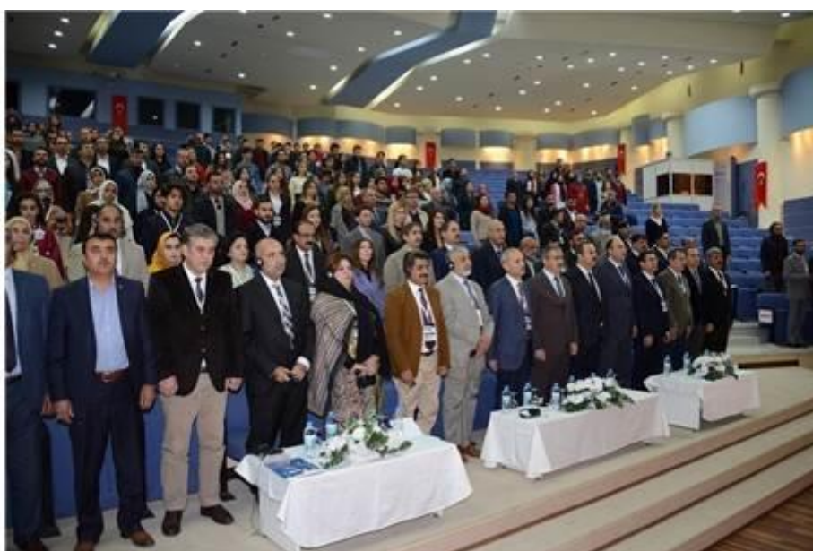
National Anthem during Dairy Science Park IV - 2017 Konya, Turkey