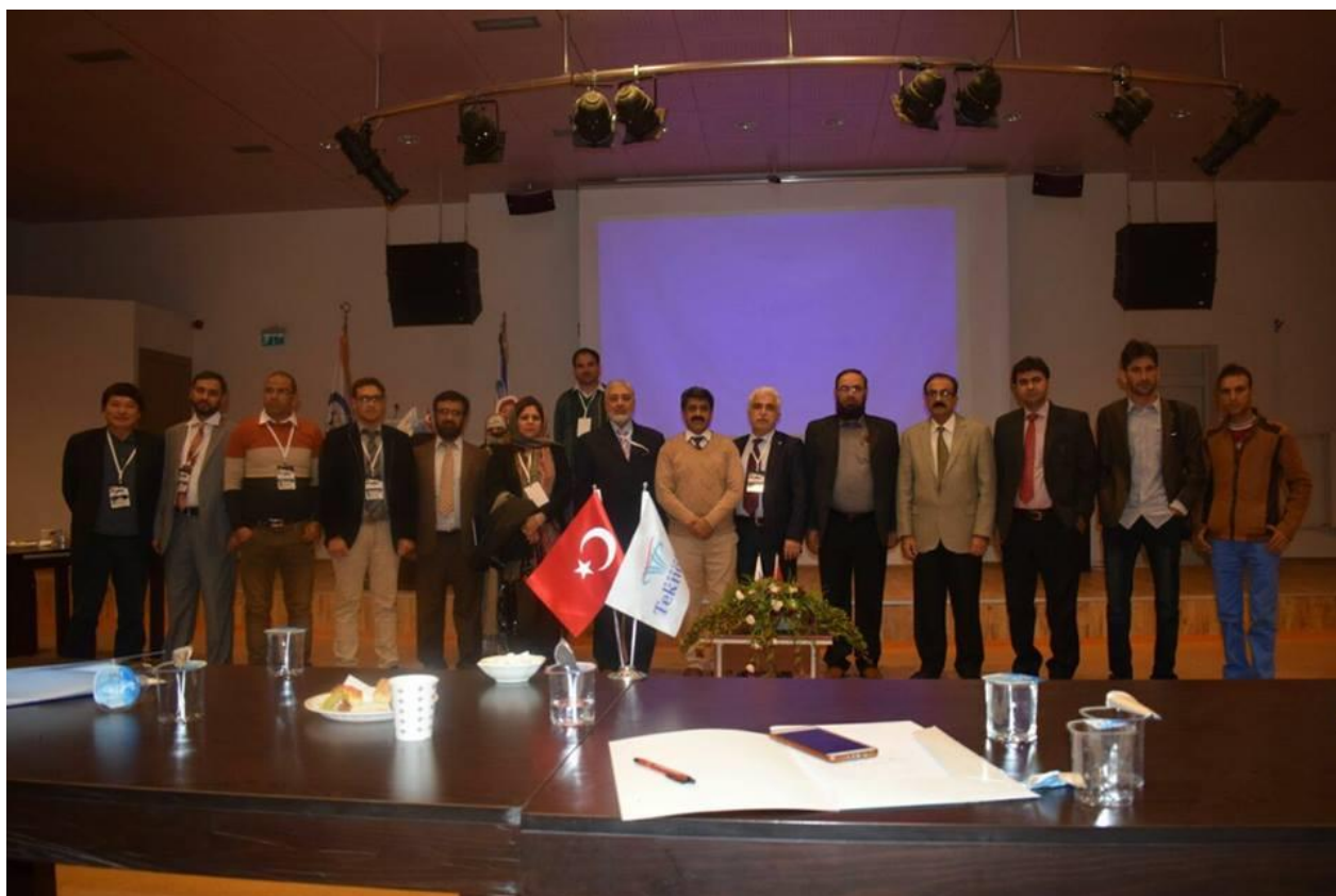
Visit of Dairy Science Park 2017 delegates to Konya Teknokent