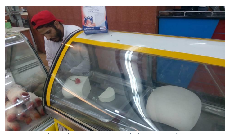
Technical Support to Local cheese marketing