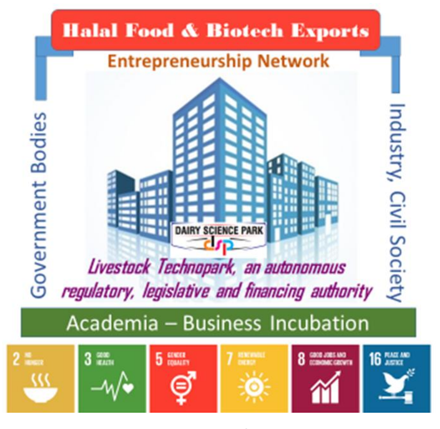
Good Governance Model of Dairy Science Park