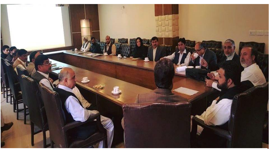
Senior Minister LG KP couldn't implement transformation agenda

Fodder/Crops Production & Mngt; v) Deputy Commissioner, price capping, no Quality Control; vi) Legal