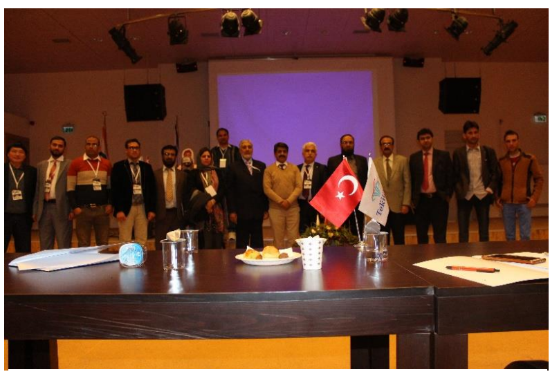
MoU with Konya Technopark could not get materialized