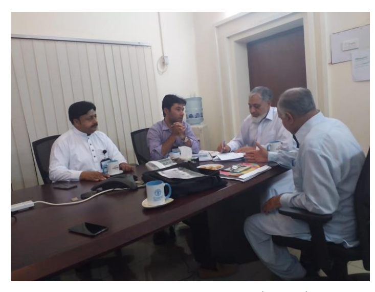
KP-LFWA representatives meet National Consultant FAO

KP-LFWA has been serving the community since 1990s. Recently the KP Livestock Farmers Convention 2019 was