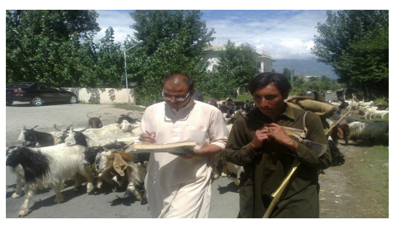
Goats farmers couldn't get attention of policy makers