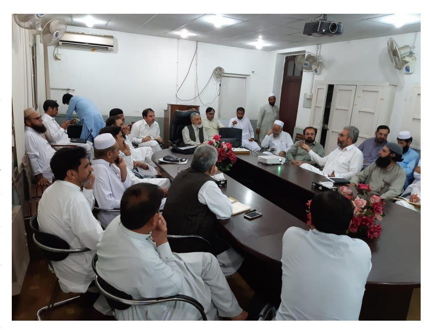
Consultation at Veterinary Research Institute Peshawar

The Author worked with Food and Agricultural Organization of the United Nations at Islamabad, Pakistan as National Consultant Livestock and Dairy Development. The mutually agreed TORs required development of an Action Plan with estimated budget for Livestock Sector Development and Transformation, based on KP Livestock Policy; covering regulatory issues, value chain development, private sector and engagement overall required capacity at provincial and district levels. The livestock and poultry farmers are facing unbearable financial burden and