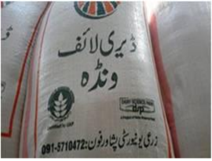
University Cattle Feed introduced in the field