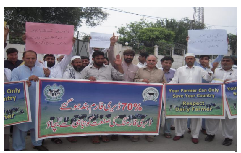
Farmers protest against lower government prices

The procurement process dictated under the Clause 30, Sub-clause (2), of the Public Procurement Rules 2004, calls for comparison of the items on the basis of cost. Here arises the issue when the suppliers offer lower prices for the items to win