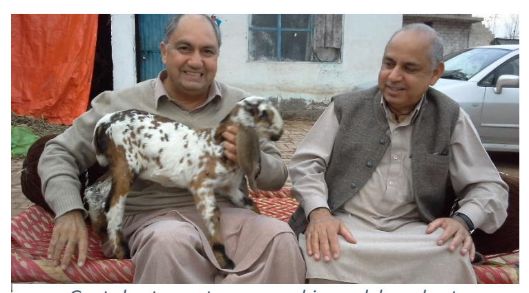
Goats kept as entrepreneurship models and pets

feet are cut. The cradle moves to any of the remaining hoists and the carcass is hoisted up and into a vertical position then moved along the line to where the flaying, eviscerating and splitting are done.