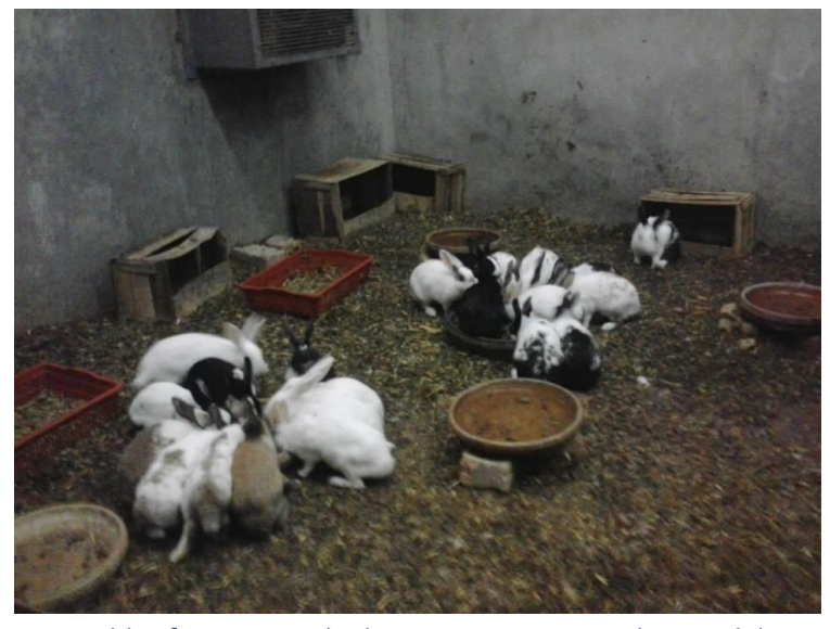
Rabbit farming studied as an entrepreneurship model