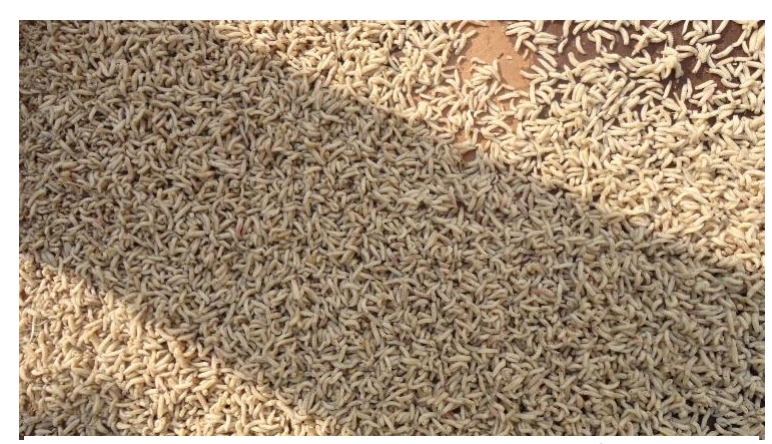
Maggots meal was studied as poultry feed

A study on effect of organic acids on the performance of Japanese quails found that net return was significantly higher by the supplementation. Two studies were conducted to investigate efficiency of artificial insemination and identification of a suitable extender and their effect on quail eggs fertility. Al showed good results in Japanese quails in term of least fertility related problem as compared to natural mating. Proctodeal gland extender was found to be very effective for fertility, hatchability,