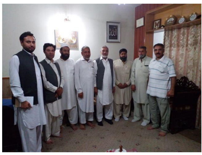
Meat processors pondered upon price regulatory issues

A meat processing factory was established at Industrial Estate Hayatabad, Peshawar with the name Peshawar Meat by DSP Innovations, to process and pack meat from sheep, goats, cattle and poultry of local breeds reared in the pastures of Khyber Pakhtunkhwa