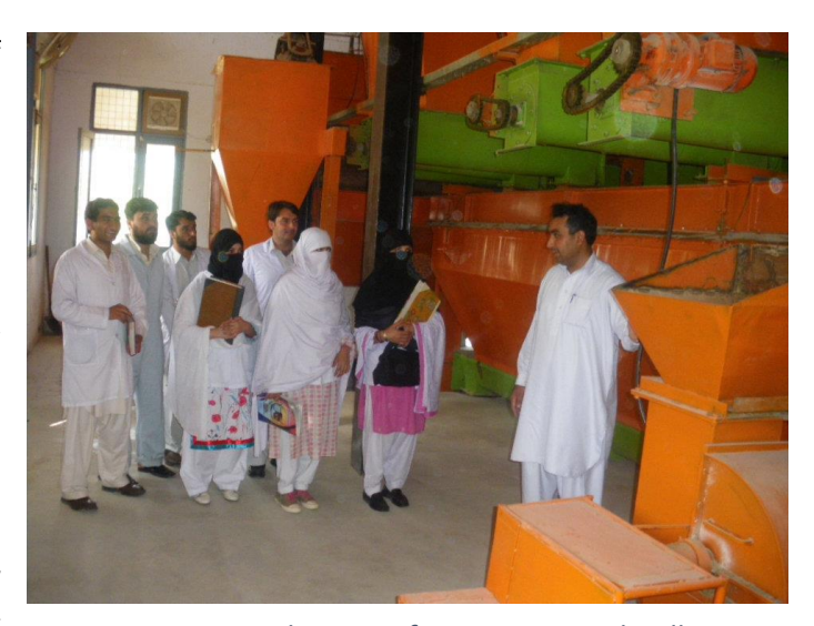
Operationalization of University Feed Mill

The Cattle Feed Mill of University of Agriculture Peshawar was run under a lease arrangement with a private partner. It has provided a gateway to the University System for applied research and an effective outreach setup for the mediums sized commercial livestock farmers. The Faculty members and postgraduate students had been utilizing these facilities for applied research and getting feedback from the farmers utilizing these products. Alternate feed resources were explored and new technologies were developed for enhancing feed utilization by the livestock and poultry