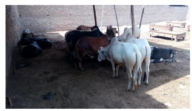
Calf fattening was introduced by DSP and KP-LFWA

In addition, many new issues have aroused which need to be addressed under this Plan. For achieving the targets inputs are required from the Directorates General Livestock and Dairy Development Department, Extension and Research Wings, Khyber Pakhtunkhwa,