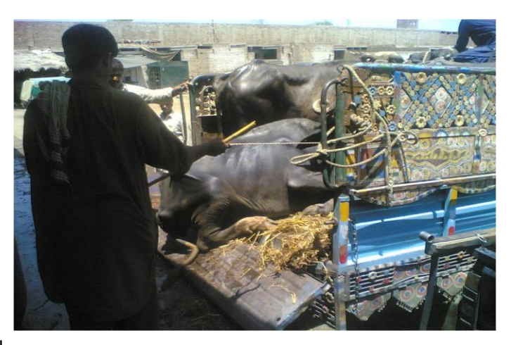
Animal Transpiration to slaughter house

A special arrangement is required for transportation of animals through a legislative act, to be conducted by some autonomous/private organization/the proposed PTP, as the public sector has no