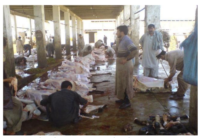
Slaughtering at Main Slaughter House