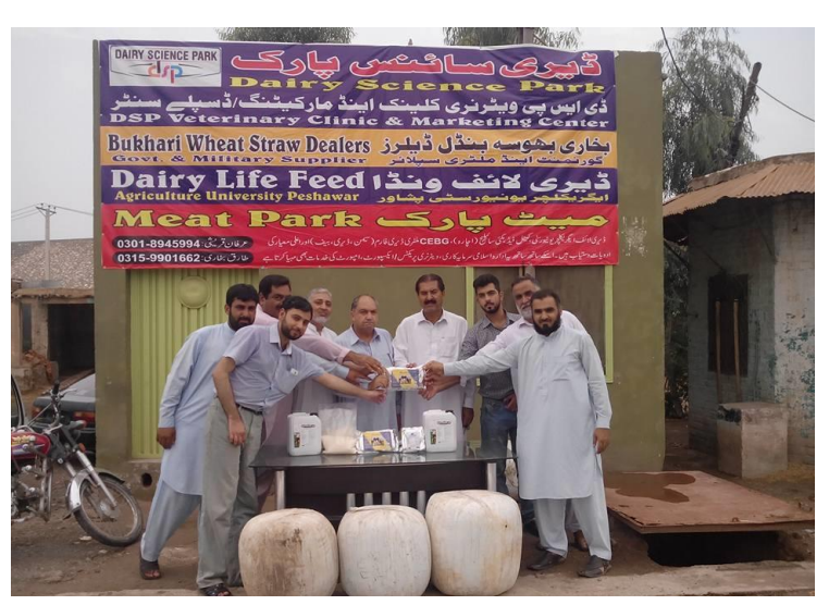
Entrepreneurship development promoted under support centers

After the bleeding, the hoist then moves to a mobile skinning cradle and the carcass is placed on the cradle, where the initial flaying operation starts and the