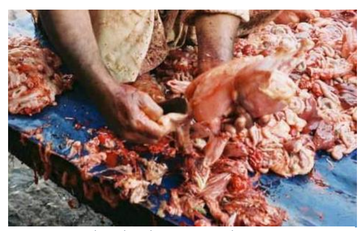
Poultry slaughtering in Peshawar city