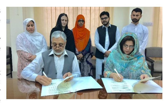
MoU signing between WUM and DSP

They provide food to the animals, milk the lactating cows, buffaloes, sheep and goats; wash the premises and perform other management tasks. The decision making is made on consensus. Women have a major role of being with the animals for most of the times and