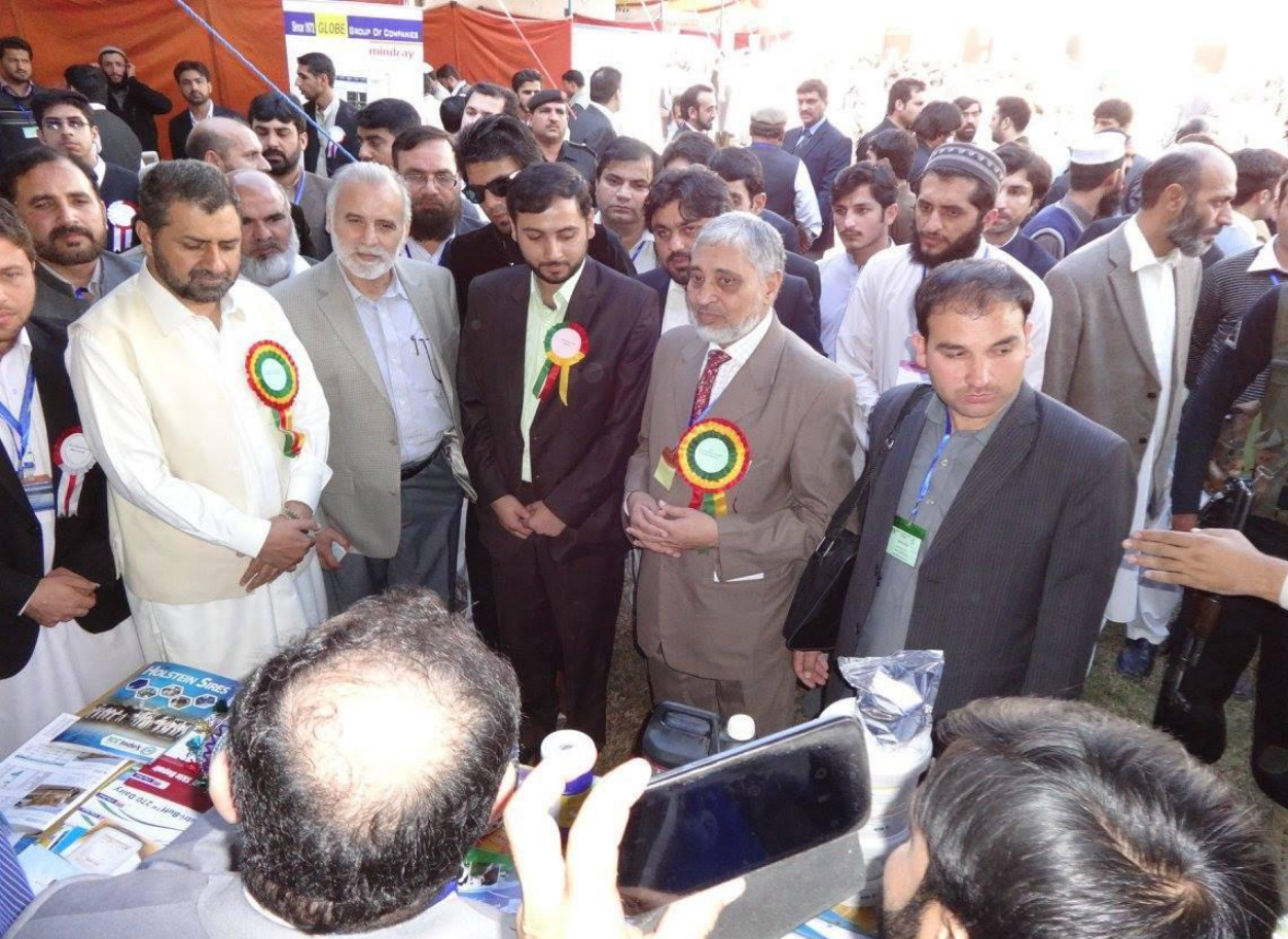
DSP III - 2015 Peshawar