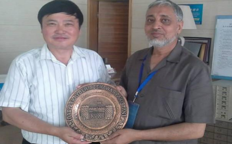
Signed MoU with Chinese Academy of Agric Science