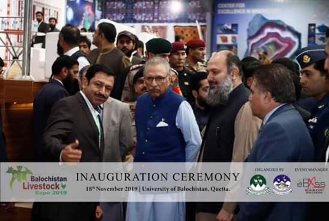
DSP V - 2019 Quetta + BLE