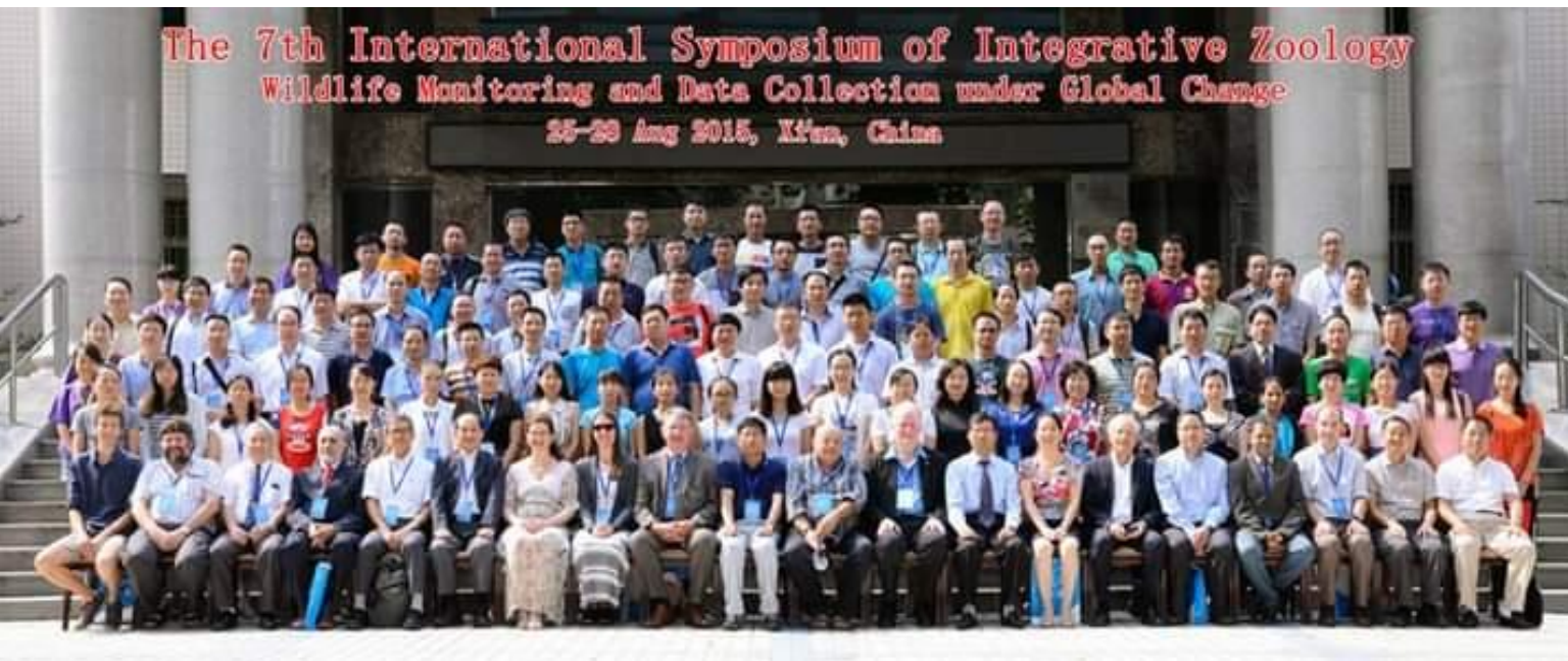
Dairy Science Park - China Collaboration