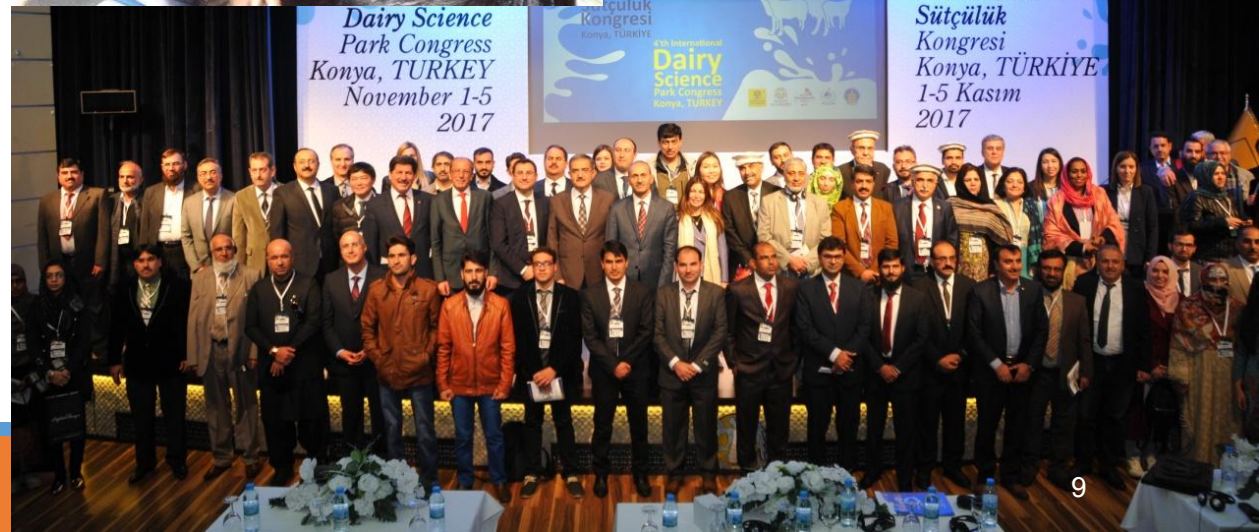
DSP-IV - 2017 Konya