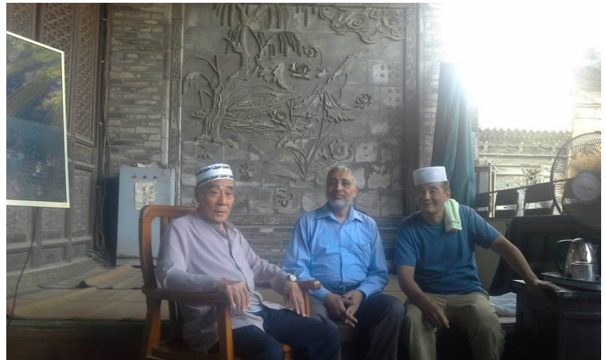
Visited Great Mosque of Xi'an